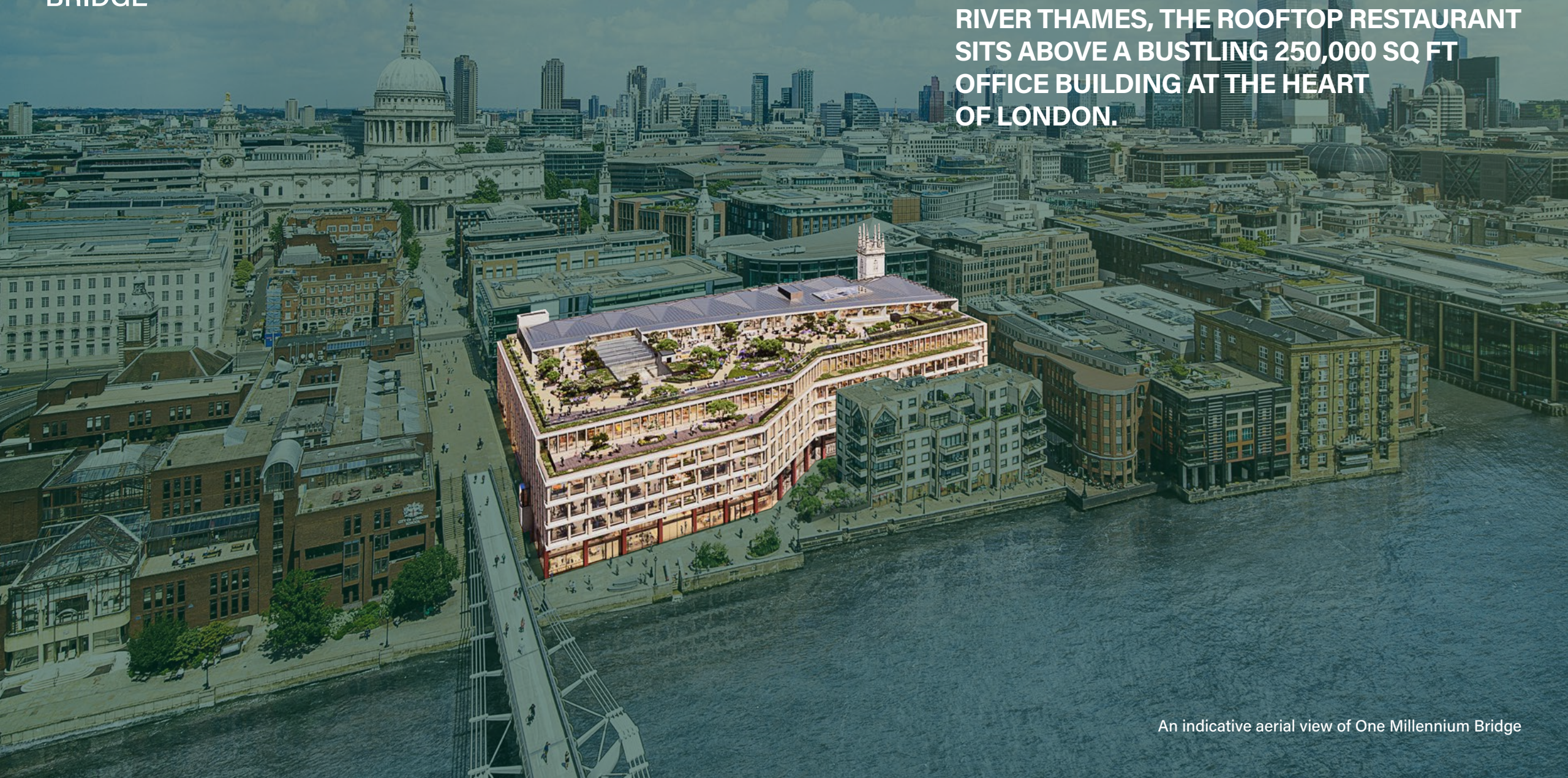
An indicative aerial view of One Millennium Bridge

SITTING ADJACENT TO THE MILLENNIUM BRIDGE ON THE NORTHERN BANK OF THE RIVER THAMES, THE ROOFTOP RESTAURANT SITS ABOVE A BUSTLING 250,000 SQ FT OFFICE BUILDING AT THE HEART OF LONDON.